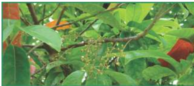
Close-up of the flowering branch