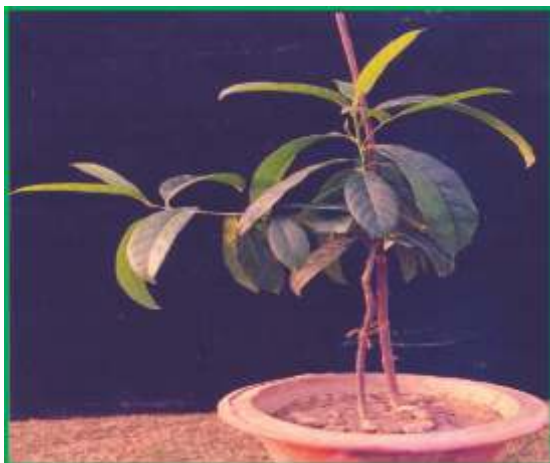
Sapling obtained from air layering