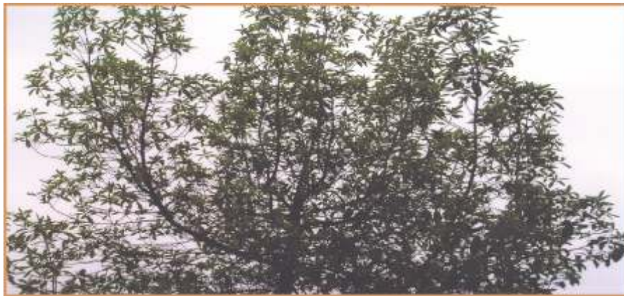
Six year old tree