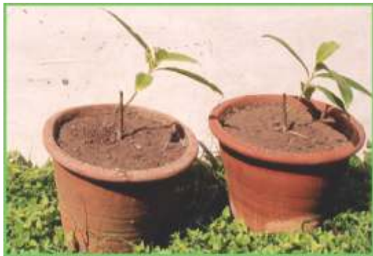
Saplings raised from cutting

Before putting the saplings developed through air layering in the field, the land should be levelled and made free of weeds. Saplings are planted in pits at a distance of 5m X 5m and the pits are filled with well decomposed Farm Yard Manure or vermi-compost.