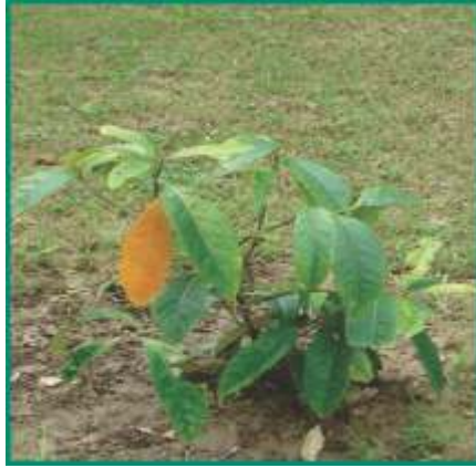
Young plant in the field,