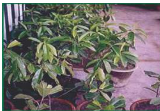
Air layered Saplings

Propagation of plant by air layering was found to be most successful method for raising plants. Air layering is usually done during the onset of rainy season and these rooted branches become ready during late rainy season for planting in the field.