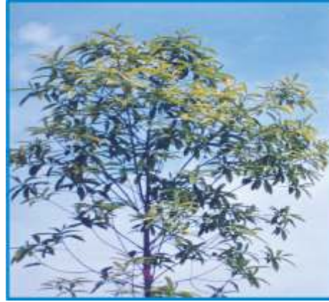
Three year old tree