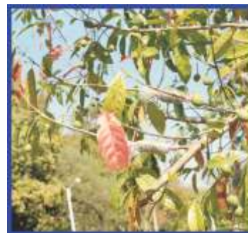
Plant of Elaeocarpus sphaericus